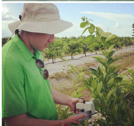
STARTUPS THAT ARE CHANGING THE WORLD PAGE 4