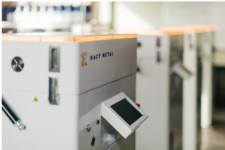
In January, Xact Metal celebrated the first shipment of XM200C machines to customers across North America. Future orders are destined for international shipment to Mexico and Saudi Arabia.