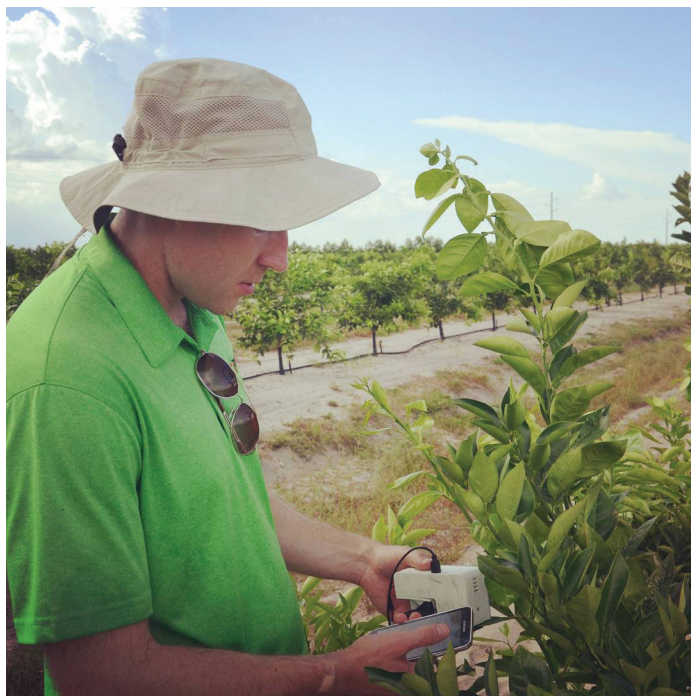
Croptix is helping citrus farmers tackle disease

"Croptix uses a combination of patented optical technology licensed from Penn State and developed in house to look inside a crop's leaves and detect small structural changes that are associated with the progression of crop disease. These small changes often happen before your eye can see it, therefore allowing our technology to act as an early identification and warning system for the farmer," CEO and co-founder Perry Edwards says.