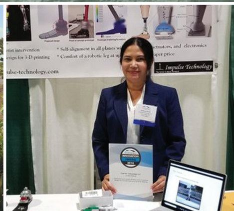
MAKING A DIFFERENCE FOR VETS PAGE 7