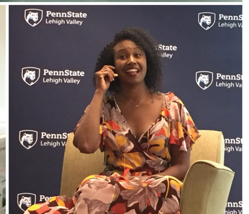
GEW FORGES CONNECTIONS THAT MATTER PAGE 13