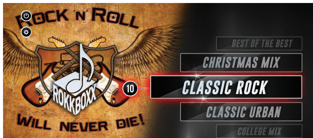
RokkBoxx is working with restaurants and bars to increase customer's dwell time