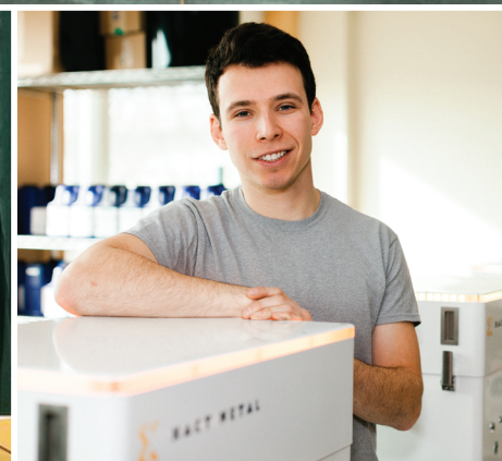
XACT METAL FILLS GAP IN 3D PRINTING PAGE 9